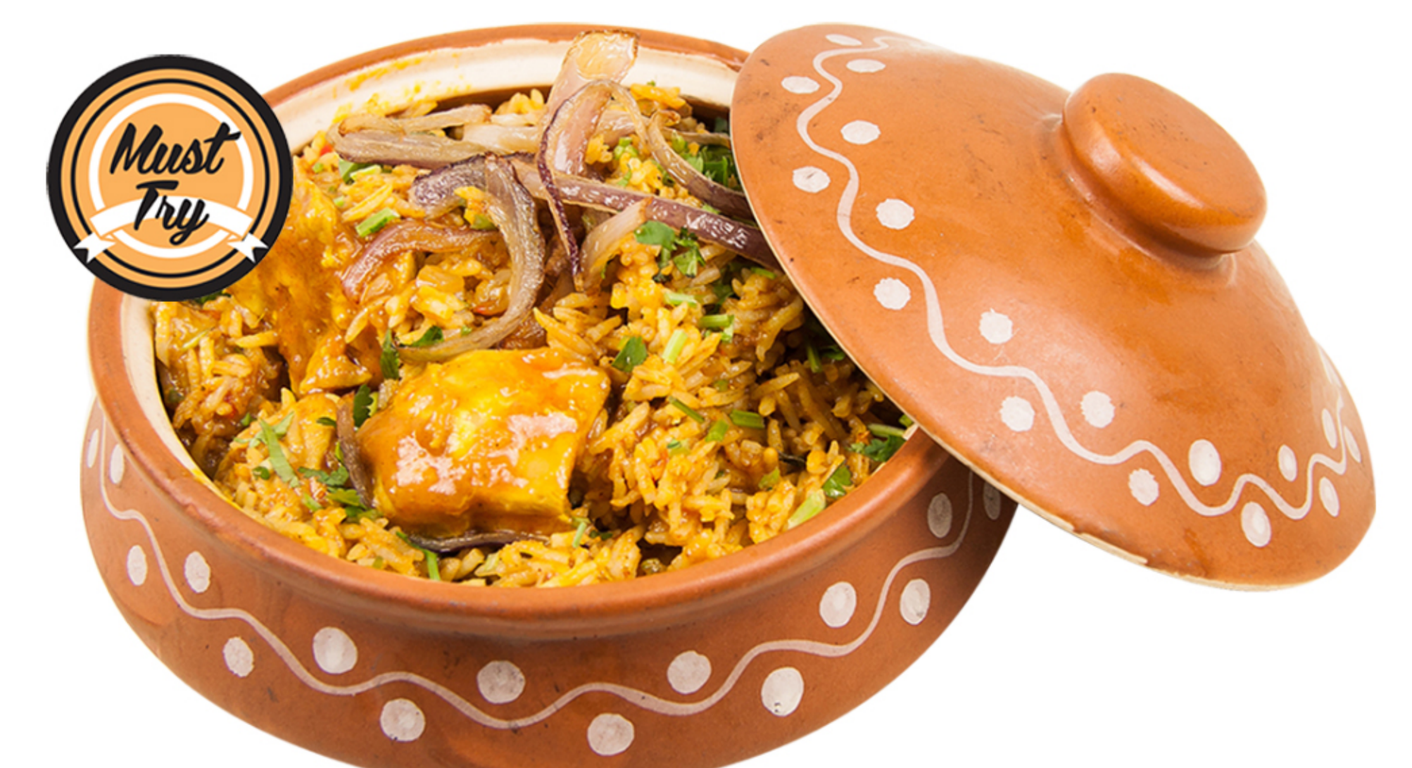
CHICKEN DUM BIRYANI