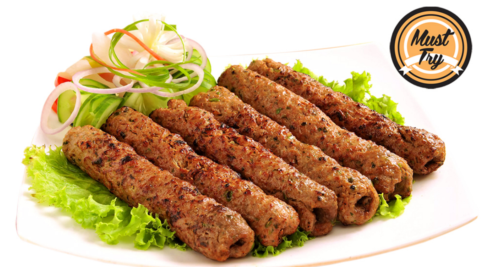
MUTTON SEEKH KABAB