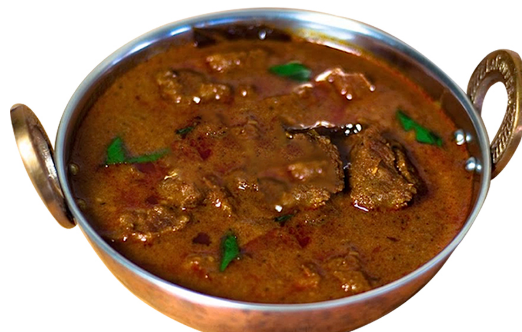
MUTTON ROGAN JOSH