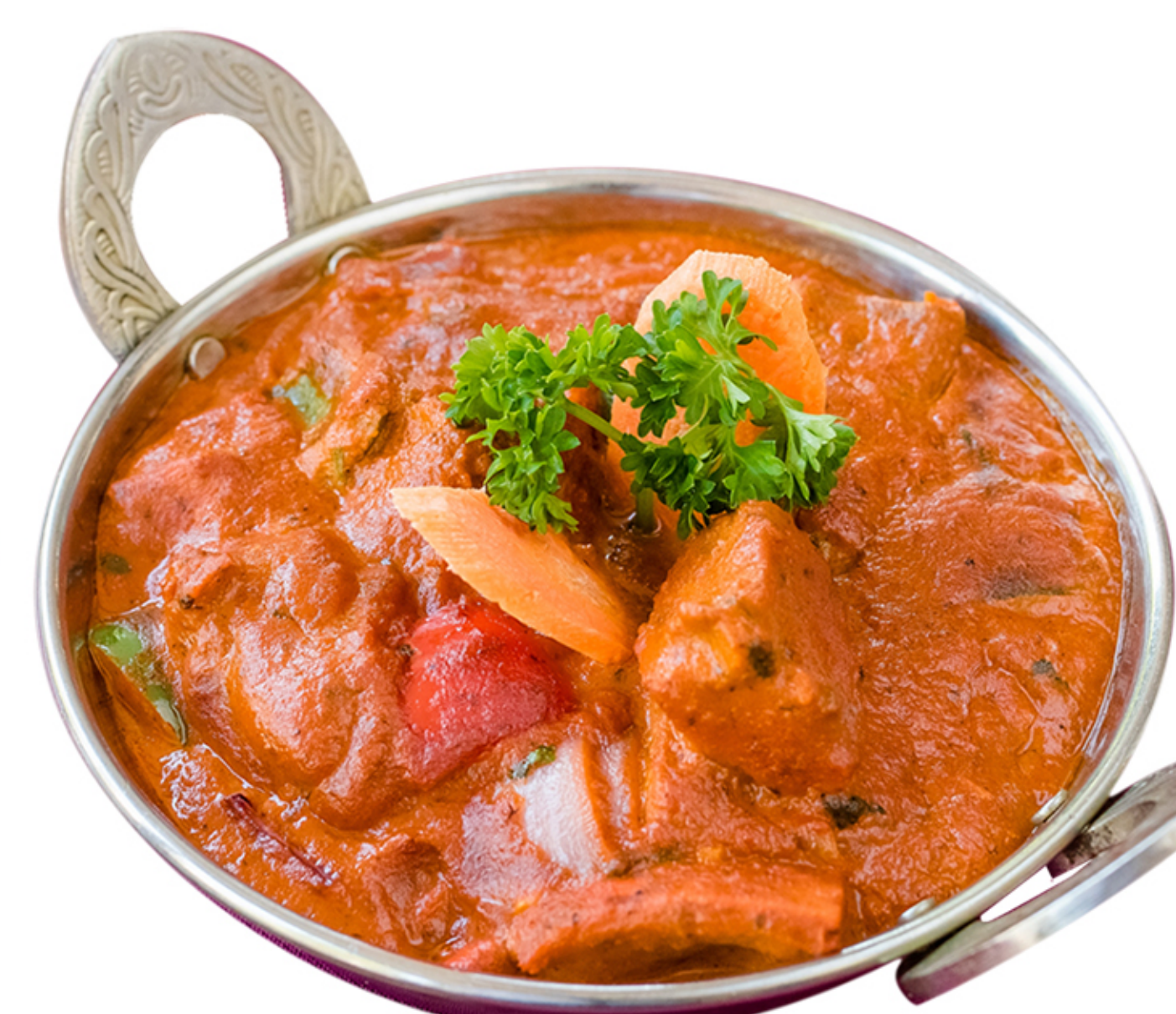
CHICKEN TIKKA MASALA