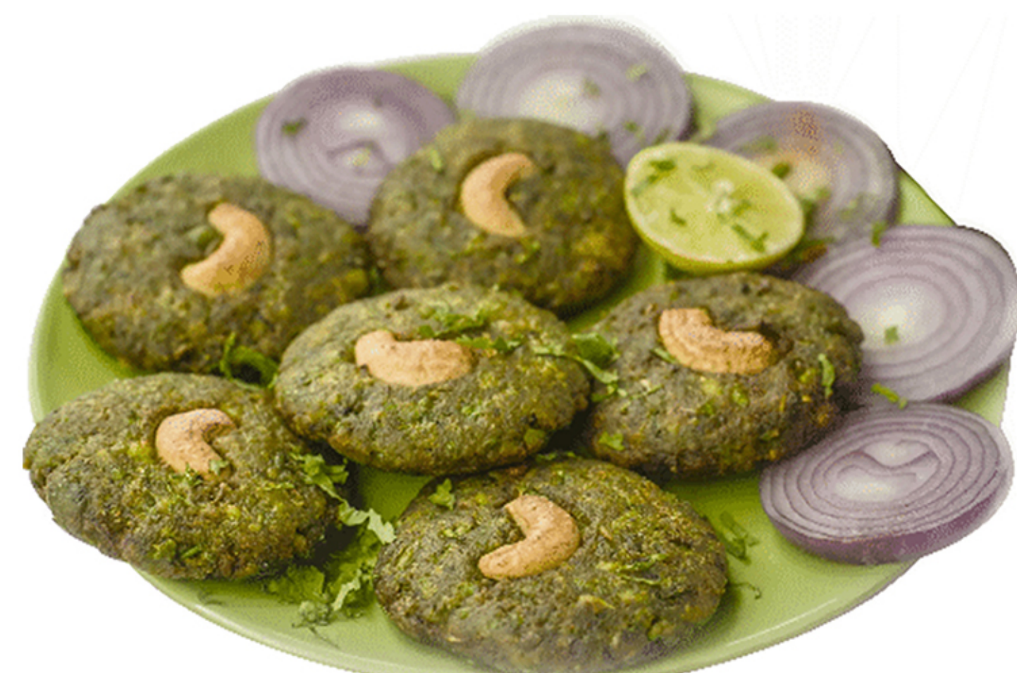
HARA BHARA KEBAB