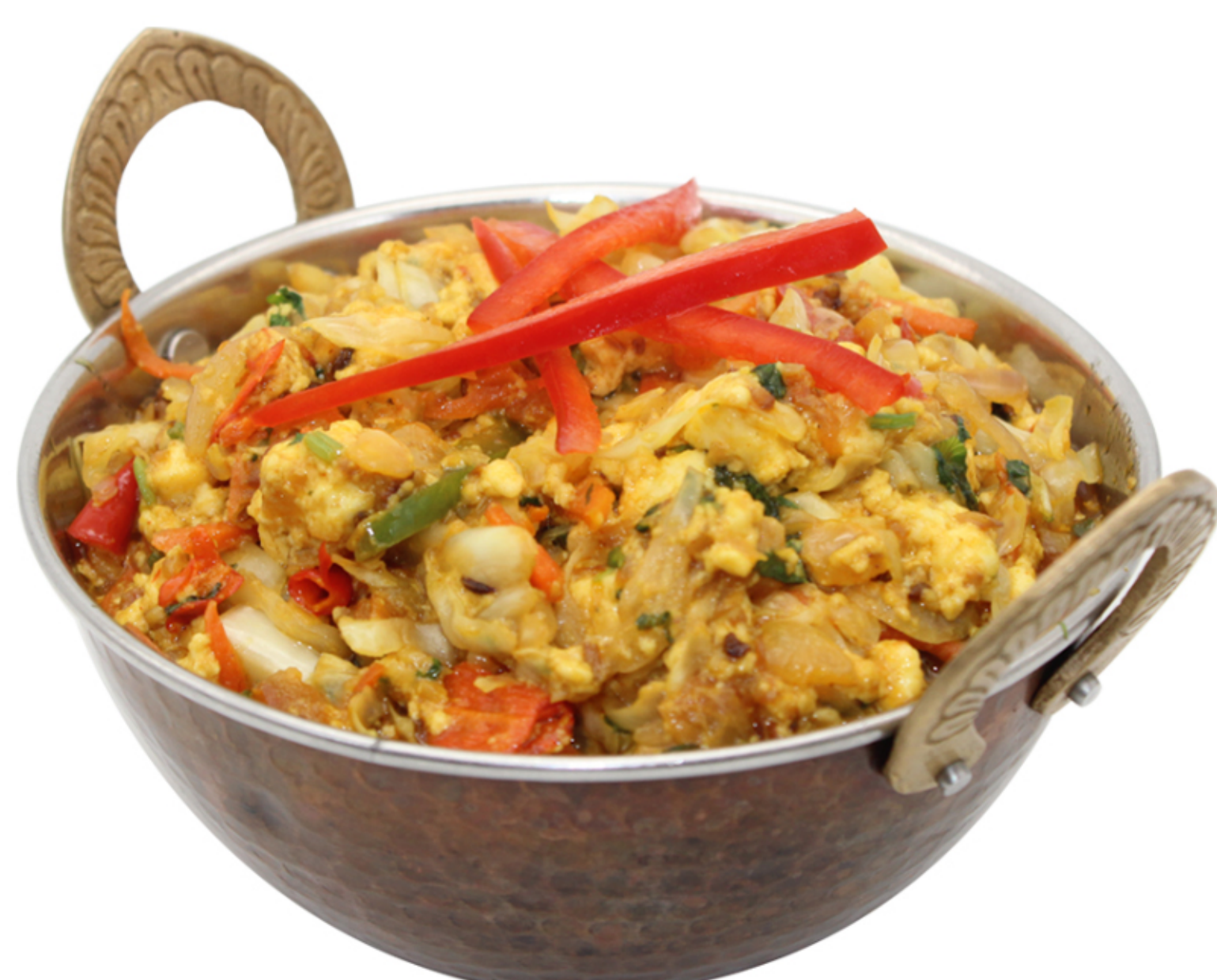
VEG CHILLI MILLI