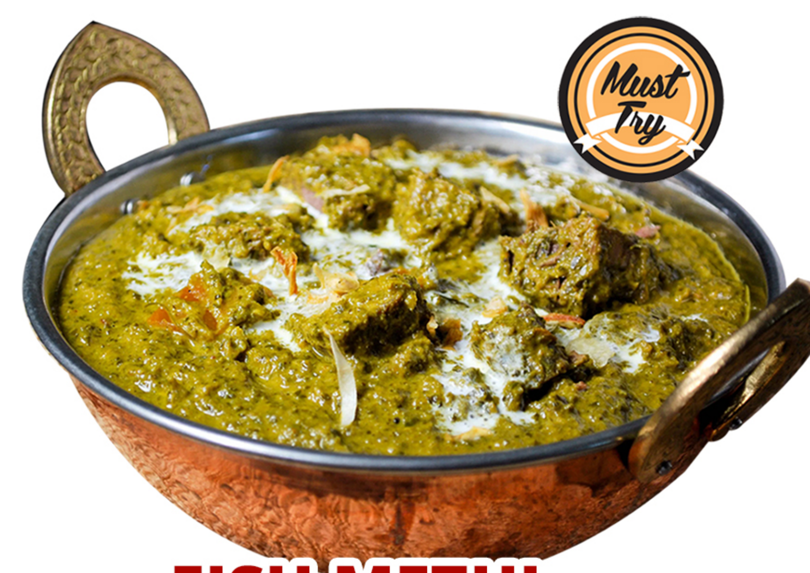
FISH METHI MASALA